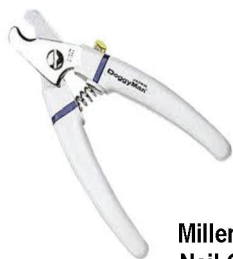
Millers Forge Nail Clippers $17.99

Odyssey Pets offers both trimming and grinding services for all-breeds. Call us, or ask an associate for details.