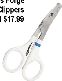
Millers Forge Nail Clippers Small $17.99